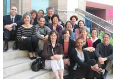
UCSF/Coro Faculty Leadership Initiative Cohort II

For more about this tremendously successful and well-received program, please visit the UCSF Today website. You can see the story at http://pub.ucsf.edu/today/cache/news/200606148.html .