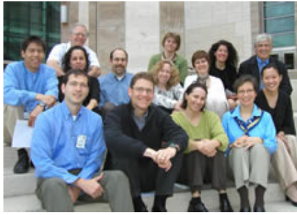
UCSF/Coro Faculty Leadership Initiative Cohort I