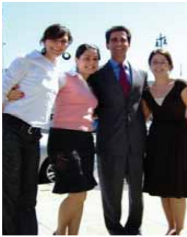
Coro Fellows with California Assemblyman Mark Leno

Focus weeks allow Fellows to sharpen their knowledge of a particular sector by learning from individuals with varying and often conflicting viewpoints. In San Francisco, Fellows spend a week at a time exploring California agriculture, the technology sector, media, communications, and state government.